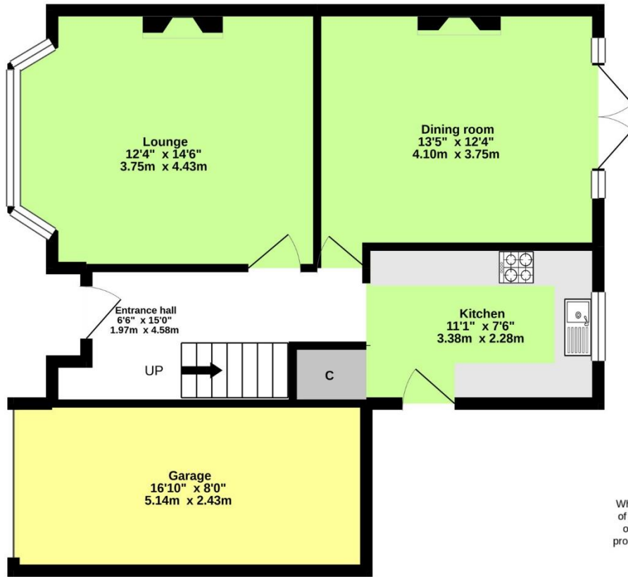
Ground floor 625 sq.ft. (58.1 sq.m.) approx.